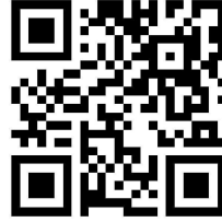
GOOGLE MAPS QR CODE

GOOGLE MAPS - https://goo.gl/maps/kGgDRXRvgX4aiFwH7